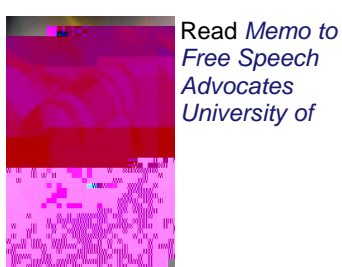
Wisconsin-Madison by Harvey A. Silverglate.

Foundation for Individual Rights in Education, Inc. 210 West Washington Square Suite 303 Philadelphia, PA 19106 Phone: (215) 717-3473 (717-FIRE) Fax: (215) 717-3440 Email: <u>fire@thefire.org</u>